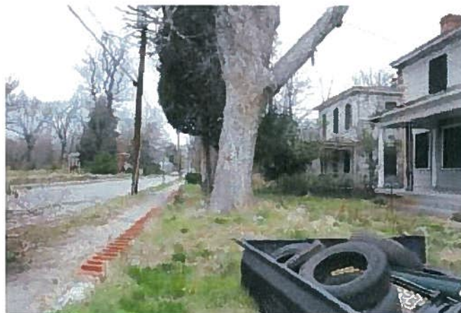
Harrison Street, looking north near the intersection with D’Arcy Street, is shown Tuesday. This neighborhood targeted for revitalization is named the Halifax Focus Group area, one of the areas of a strategic neighborhood pla