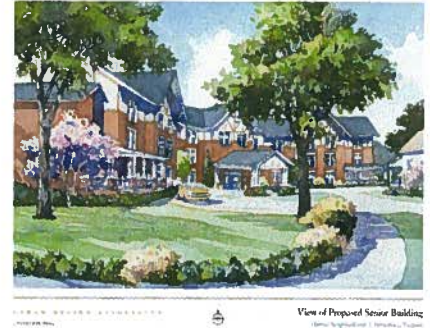
View of Proposed Senior Building

Halifax neighborhood in Petersburg. This is the first multifamily housing development to result from the LISC community engagement process nearly two years ago and resulting community plan which was supported by the Cameron Foundation and the City of Petersburg. Claiborne Square Apartments will include 43 apartments in the main building and a cottage with four additional units. The complex will be certified under the EarthCraft Multifamily program and incorporate green building technologies which go beyond EarthCraft such as installing solar hot water heaters.