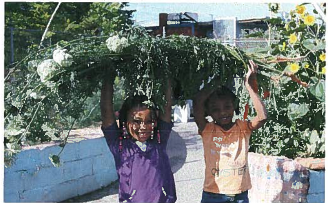
Learning to grow carrots in NRC's learning garden

of the Local Initiatives Support Corporation (LISC) to help create healthy and sustainable communities. The Greater Fulton neighborhood is the first of three Richmond