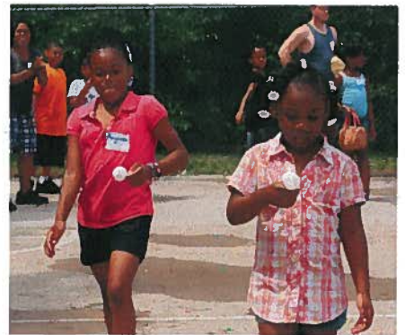
Two youngsters enjoy the egg relay.

For more pictures, visit our facebook page .