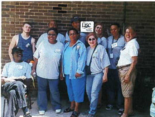
LISC AmeriCorps Members with Mayor Mickens

ride. This was a day of joy for residents of Pecan Acres Estates.