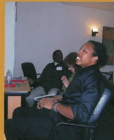
Sho-Dan at a recent AmeriCorps Training