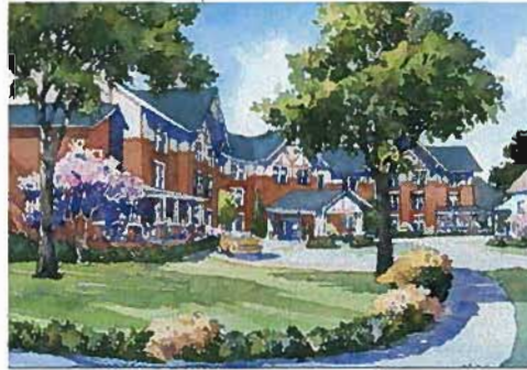
Claiborne Square rendering