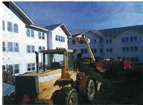
Claiborne Square today