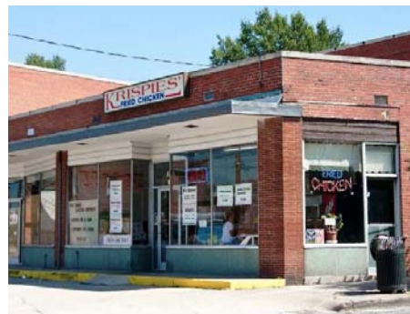
Fulton Commercial Corridor

The Local Initiatives Support Corporation, to provide those in the community development field targeted training and technical assistance based on practice, founded the Institute for Comprehensive Community Development (the Institute) in 2010. The Institute in addition to training and technical assistance also promotes research in comprehensive development and investigates public policies that would best advance community development work locally and nationally. Through fieldwork, staff at the Institute found that many of the Sustainable Communities sites recognized the importance of addressing