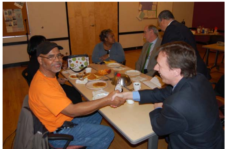
Residents and City Staff enjoy dinner and discussing the future of Battersea