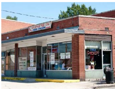
Fulton Commercial Corridor

The Local Initiatives Support Corporation, to provide those in the community development field targeted training and technical assistance based on practice, founded the Institute for Comprehensive Community Development (the Institute) in 2010. The Institute in addition to training and technical assistance also promotes research in comprehensive development and investigates public policies that would best advance community development work locally and nationally. Through fieldwork, staff at the Institute found that many of the Sustainable Communities sites recognized the importance of addressing