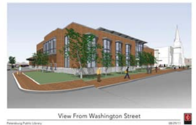
View From Washington Street Petersburg Public Library