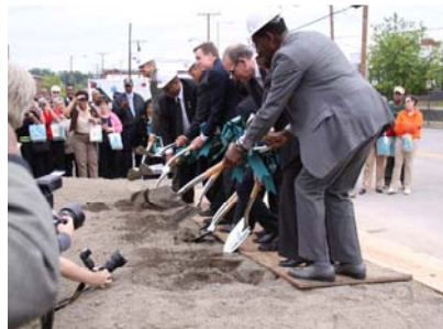
Senator Warner and Delegate Dance with shovels