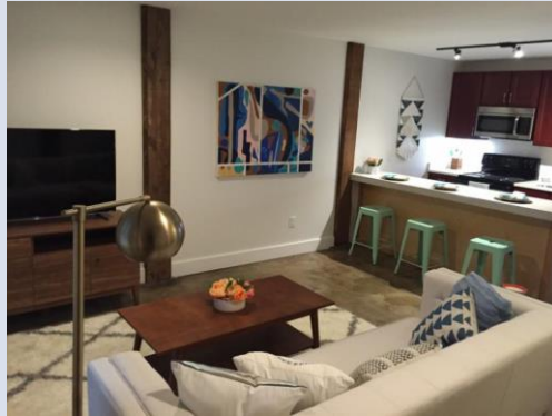
Renovated apartment.

Eight tenants have already moved into The Bosco, and five more will move in this month. Blind Tiger Film Works will move in as soon as Waukeshaw Development completes the final touches on the commercial space.