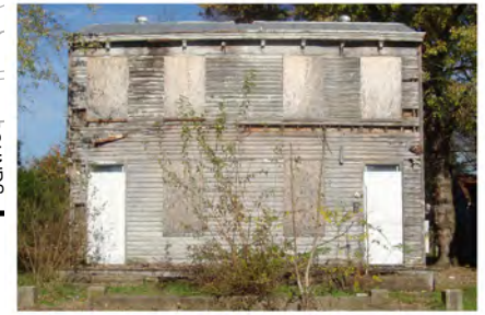
1145 High Street - Before