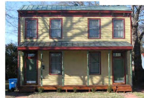
1145 High Street - After